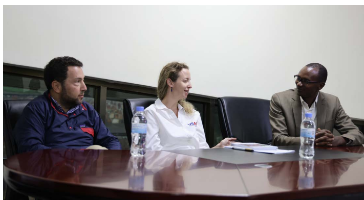
USAID officials interacting with the Mayor of Nyanza District during the joint visit.

On 20th March, a joint site visit was organized by USAID to visit on-ground interventions in Nyanza District by both Isoko y'Ubuzima and Gikuriro Kuri Bose projects. USAID representatives got a chance to interact with Nyanza District leadership and hear from them about the support they are getting from the two projects. Representatives also learned about the interventions from Isoko y'Ubuzima and Gikuriro Kuri Bose that are embedded into district plans and priorities. After interacting with the District Leadership, the USAID representatives had a chance to visit the community interventions like the Nurturing Care Hub from Gikuriro Kuri Bose, the Village Savings and Loans Associations supported by the Isoko y'Ubuzima project, and finally had a brief interaction with the PO providing water services in Nyanza District and his plan to reduce NRW with the support of Isoko y'Ubuzima.