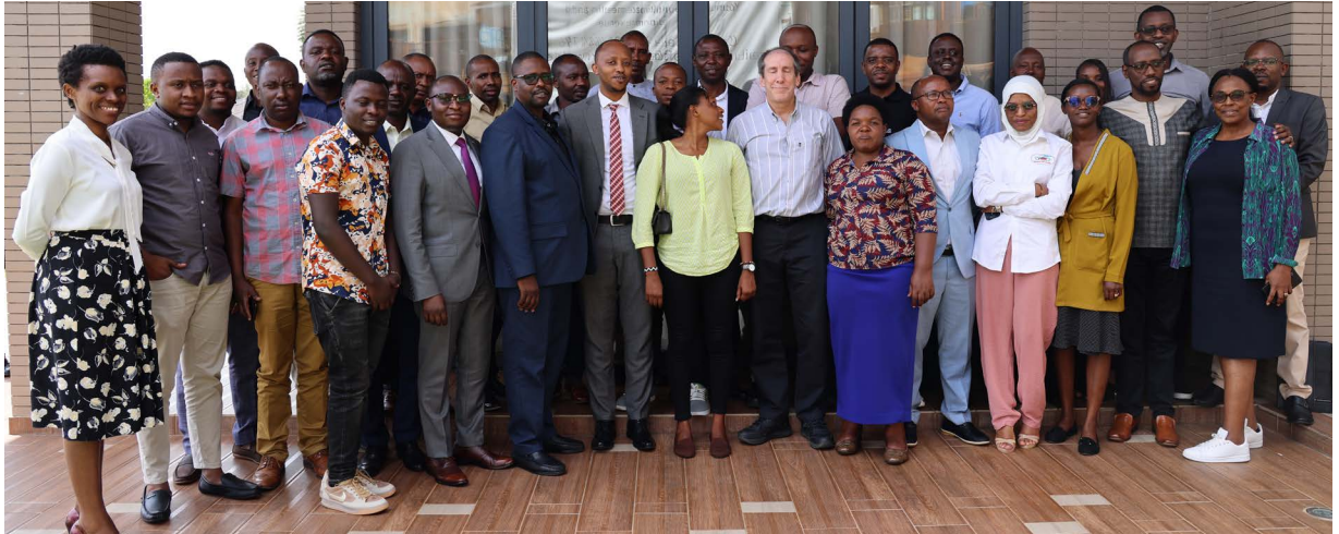
Group photo of stakeholders who attended the customer management system review meeting.

Isoko y'Ubuzima is supporting the Government of Rwanda to develop a Customer Management System (CMS) that will help improve the water services delivery in 10 districts of the project. The system will also be used in the remaining 20 districts.